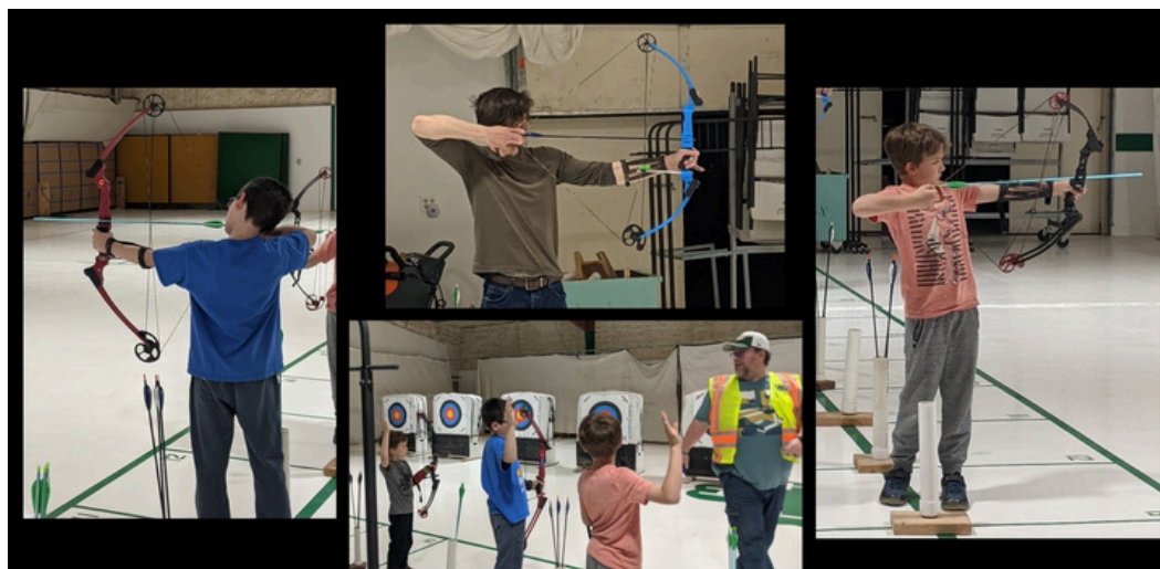
Wild Roses – Learning Archery

An important safety requirement that was stressed is that you don’t go forward to your target to get your arrows until everyone is done shooting, and it is announced or you hear a designated whistle blast to know that the range is safe