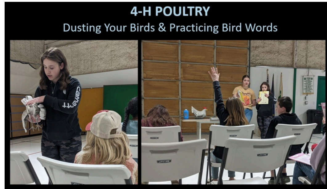
March Poultry Workshop

Join our Facebook page “Lewis & Clark 4-H Poultry project.”