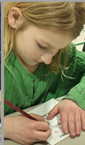
2 - Color the Valentine card