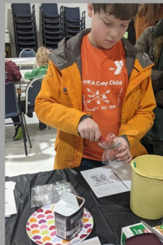
1 - Bag the Hot Chocolate Mix