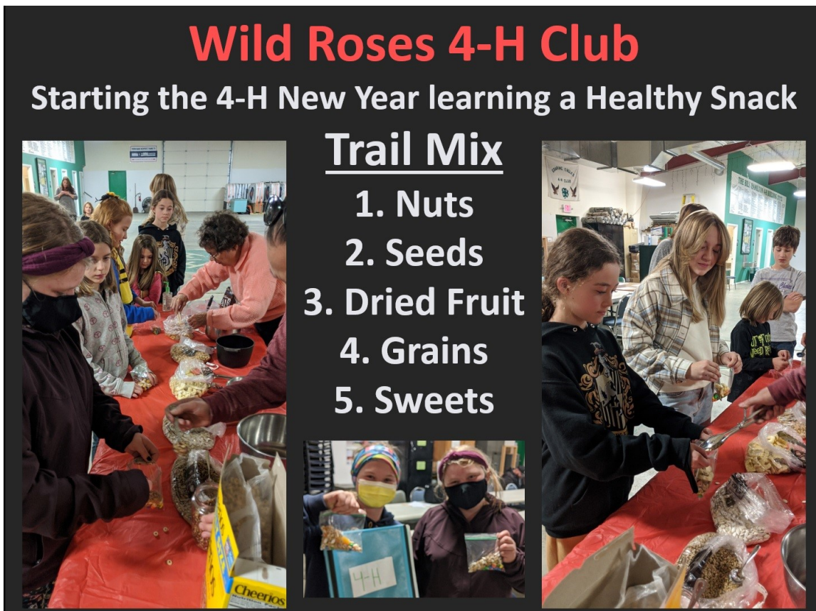
Trail Mix photos by C.J. Lassila.

Wild Roses 4-H Club typically does a 4-H project-related activity at each meeting. This month, since a Foods workshop was already held, the club members learned about nutrition by hearing about Trail Mix healthy snacks and having the opportunity to create their own Trail Mix snack this evening. Club members learned: 1. Keep trail mix in cool, dry location a to prevent it spoiling. 2. Eat while hiking or doing another strenuous activity. Trail Mix is lightweight, portable, and full of energy ingredients. 3. Mix and Match your ingredients, using items you enjoy eating. 4. Healthy ingredients should include a combination of Nuts, Seeds, Dried Fruit, Grains and Sweets. To create their Trail Mix, club members selected from peanuts, pecans, pumpkin seeds, sunflower seeds, dried apple, dried mango, cheerios and M&M candies.