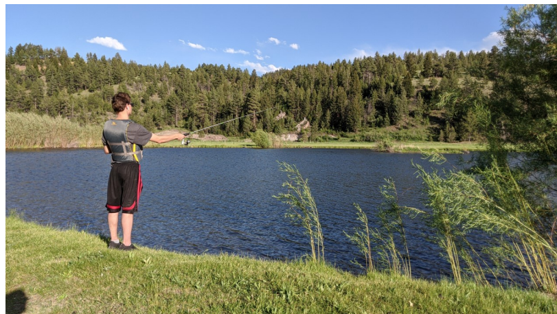
Sport Fishing near Helena.

LEARN FISHING BASICS! Enroll now in the 4-H project of Sport Fishing. This year's Sport Fishing project will begin in April 2022 with meetings every Tuesday evening until mid-August. Our weekly meetings typically include workshop topics such as fishing knots, Montana fishing regulations, fish identification, rod & reel maintenance and casting practice. Project members will begin outdoor fishing in May, getting an