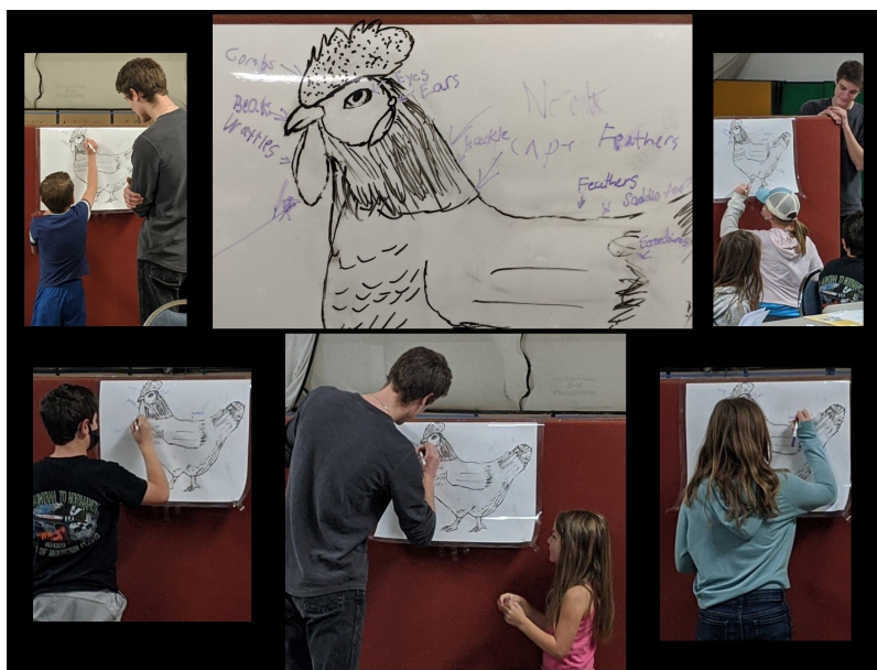
October Workshop: Identify Poultry Parts & Learn Poultry Words.

All project members and family are invited to join our Facebook group page under Lewis & Clark 4-H Poultry project.