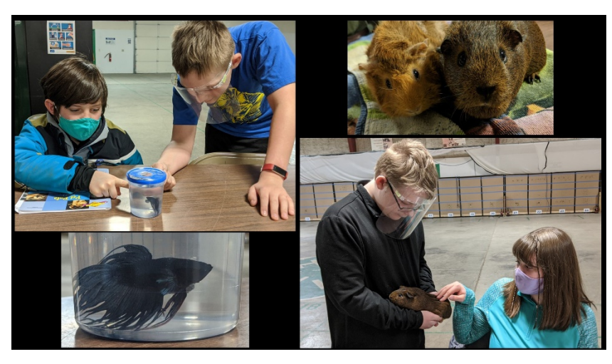
Project members experience two guinea pigs and a crown tail betta.

Pets can go to a new, happy home if it does not work out for the original purchaser. But this is also about why, as much as possible, people should do research and be sure about getting a