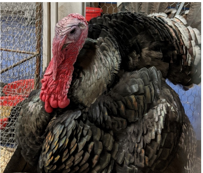
Turkey exhibited by William Bushnell - 2020 Fair.

Next Poultry Workshop: Saturday, January 2<sup>nd</sup>, 2021, at 1:00 pm in the 4-H Bill Hamilton Building