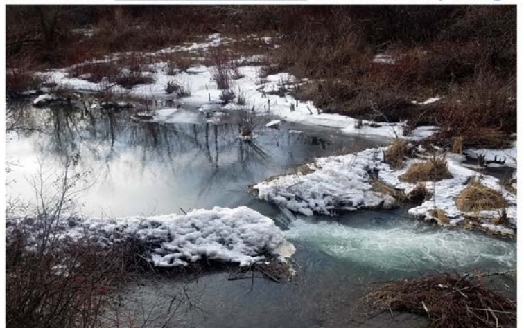
January 2021 in Wolf Creek Canyon by Guy Rainville.

It's winter. Fish are in this water. What are they doing?