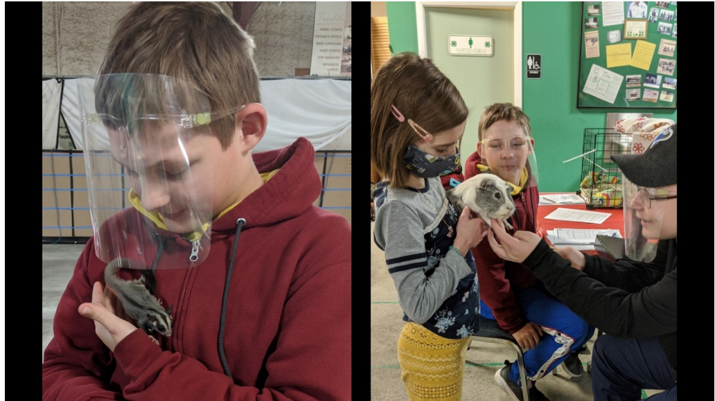
Pocket Pets members enjoy a sugar glider and a guinea pig.