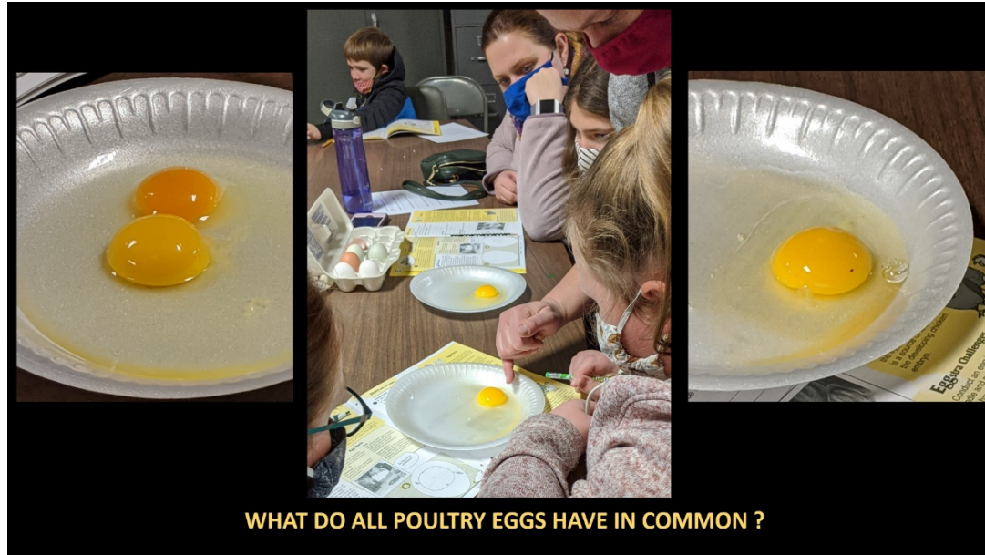
WHAT DO ALL POULTRY EGGS HAVE IN COMMON ?

“What do all Poultry eggs have in common?” was the overall theme for our January in-person workshop on Saturday, January 2 nd 2021 in the BHB. Level one project members did pages 14 & 15 of Poultry Project Book level one (“Scratching the Surface”) that had them working on a section called