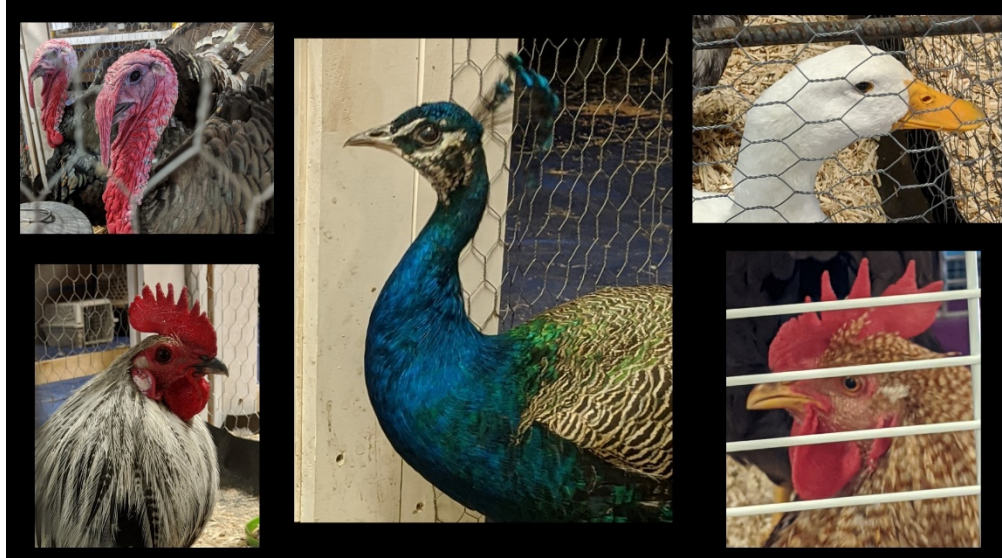
Poultry Faces at the Lewis and Clark County 4-H Fair 2020.

POULTRY PROJECT MEMBERS! See you at our first workshop of the new 4-H year. It will be on Saturday, October 10<sup>th</sup>, 2020, at 1:00 pm in the Bill Hamilton 4-H Building BHB. Please be ready to share your comments about the Fair and discuss what you would like to see happen at our monthly project meetings this year.