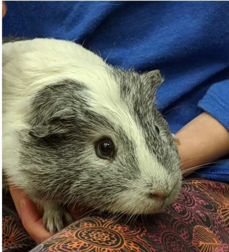
Lewis & Clark 4-H Guinea Pig Pocket Pets.

enjoy with their Pocket Pets. Remember that spending time together - you with your Pocket Pet - helps to develop a relationship between you and your pet, helps to develop trust, and helps to keep your animal tame. Your pet may just enjoy snuggling and being with you while you watch television or read a book, or even do homework. How about if your pet is a fish? Fish do feel vibrations - so listening to music is something you could do with your fish.