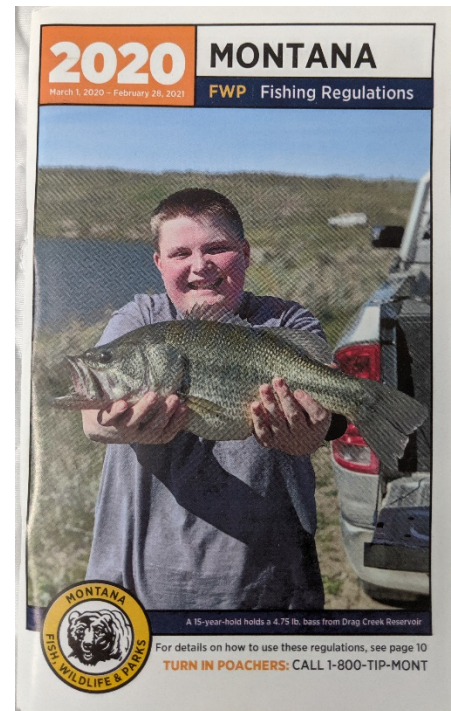
Photo: 2020 Fishing Regulations booklet from Montana FWP – carry with you while Fishing!