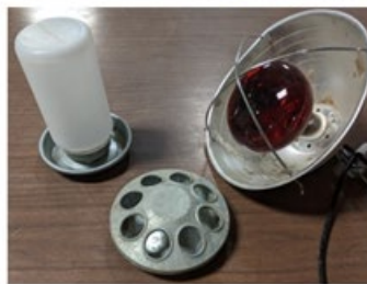
Items for your Brooder