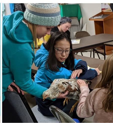
Poultry project members inspect feather patterns.

check out their feather patterns. The level 2 activity for this meeting was to do "My Poultry Business