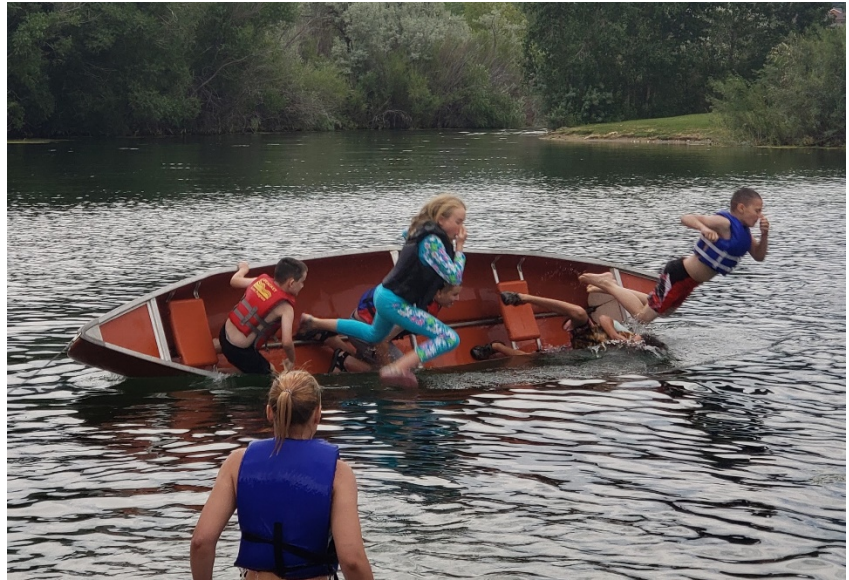
Both fun and learning water safety are part