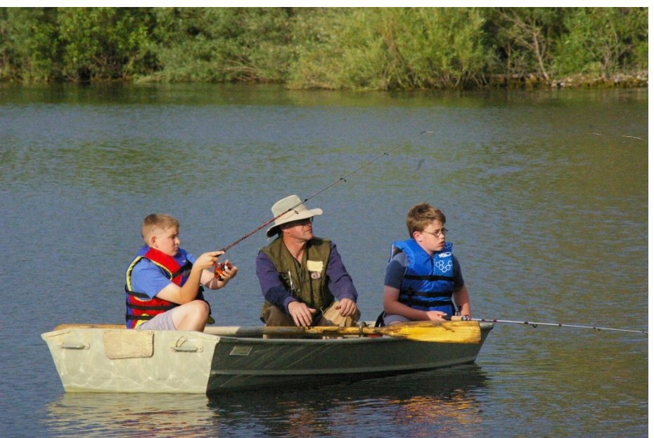
4-H Sport Fishing at Spring Meadow Lake in Helena.

officially enrolled in the Sport Fishing project. Our weekly workshops will include topics such as fish identification and Montana fishing regulations. You can get a jump on some of