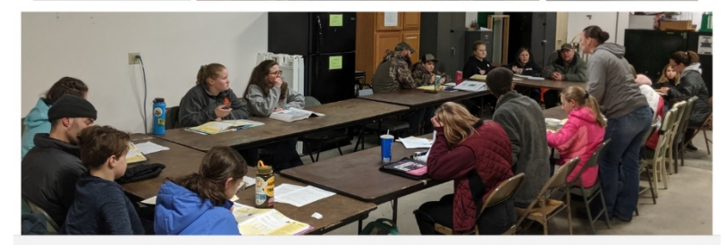
Project members learning Poultry terms and Poultry breeds.

Our March workshop was on Saturday, March 14<sup>th</sup> in the BHB. For this meeting - project level one members did pages 22 and 23, "Talk the Talk", of Poultry Project Book level one