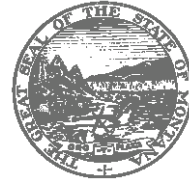
Steve Bullock Governor